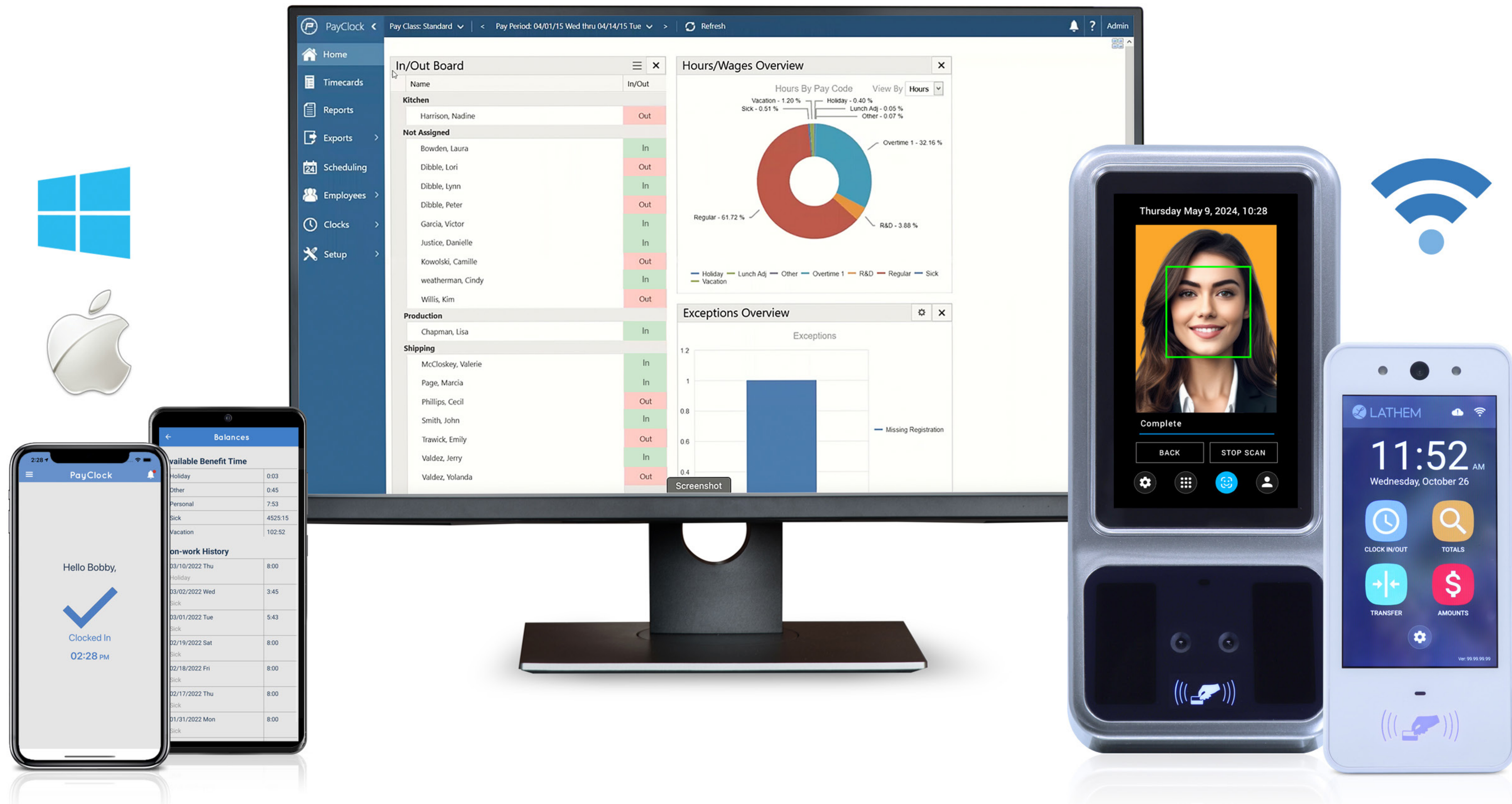
Free Mobile Apps